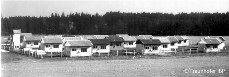
Figure 1. The 26 test houses seen from the south after their completion in 1952. They are set up on the outdoor testing field like on a chessboard.

The main goal of the initial experiments was to investigate moisture related characteristics of building materials and their consequences for the building fabric and the interior conditions. It has been consensus that test buildings are more representative for the real life situation than laboratory tests whose practical relevance was largely unknown. The research question of that time dealt with the possibility to reduce the postulated minimum thermal insulation value of vapor absorbing building materials due to their “humidity buffering capacity”. From today’s point of view a rather unusual question, but building materials were scarce and real insulation materials were hardly ever used for wall construction. Tests carried out and evaluated between 1952 and 1956 showed that the thermal resistance is a suitable parameter for assessing the hygrothermal performance of building components. This means the problem of interior surface condensation and mold growth in winter can only be solved by requiring a minimum thermal resistance for building envelope components. These findings concluded the original test series.