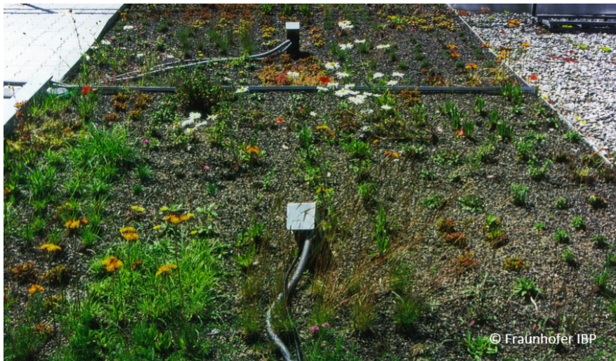
Figure 5. Green roof with temperature and humidity sensors recording the hygrothermal conditions at various positions.

The flat roof is, to the same extent as the external rendering, typical for field experiments. Already in 1957 three test houses were built in order to examine relevant problems of the time. In one case an unventilated flat roof structure with insulating corkboards of 25 mm thickness was compared to a ventilated structure with 15 mm thick corkboards. It was believed that the additional ventilation gap of the structure would save 10 mm insulation material. Today, we talk of more than 200 mm of roof insulation in Germany, because the roof is the most critical envelope component in term of heat losses or solar heat gains.