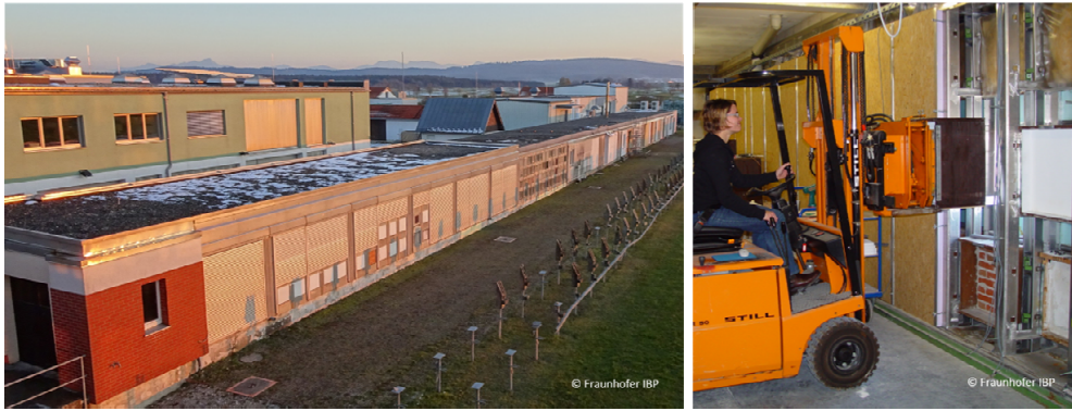
Figure 4. Air-condition test hall with removable wall elements from outside and inside.