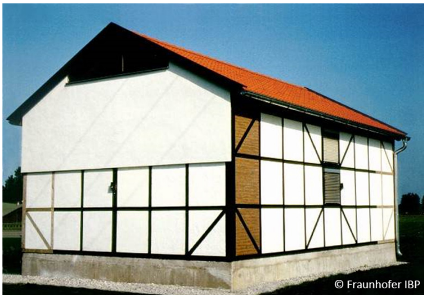
Figure 7. Half-timbered “Tudor” test house with different infill materials with and without interior insulation. Because of the unavoidable dilatation of joints and the moderate original wall thickness - a result of the framework construction - special problems regarding thermal insulation and driving rain protection can occur.

Another important research topic concerned the retrofit of buildings whose original appearance must be preserved which means their façades must not be altered. In such cases the application of interior insulations systems is the only possible solution to save energy and to enhance indoor comfort. However, in cold and moderate climates insulating walls at the interior can be risky because it lowers the average temperature of the structure and may lead to condensation and reduced drying potential. Therefore, extended investigations were carried out at a “Tudor” test house that was erected according to old traditions (Fig. 7). Apart from testing new infill materials such as mortars with polystyrene beads or different types of insulating clay mixtures, most of the studies concentrated on the effect of different interior insulations systems on the moisture behavior of the wooden structure.