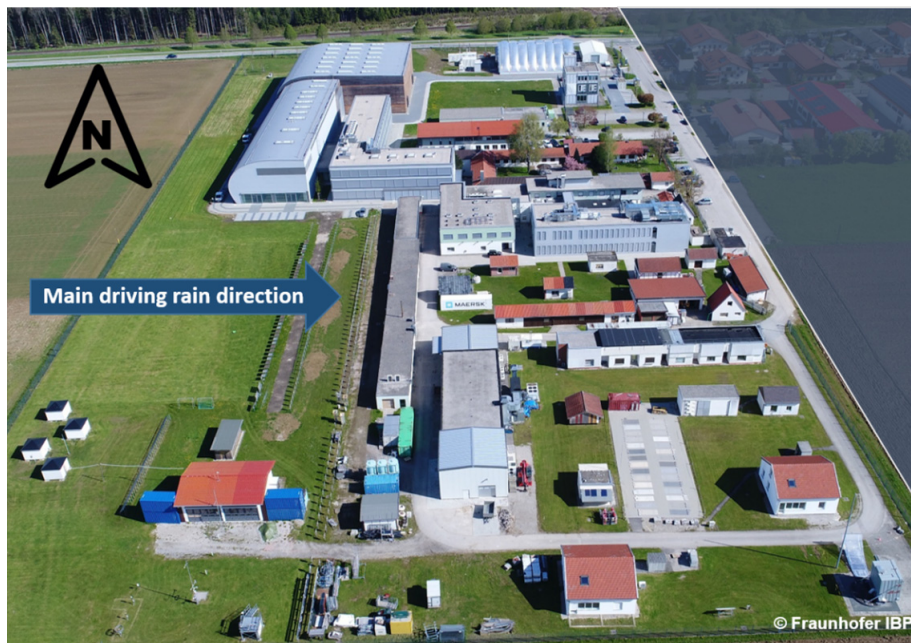
Figure 2. Aerial photo taken of the outdoor testing field from the South. A few of the original test houses are still there in the middle part of the picture. Some of them have been altered or converted in the meantime. The voluminous structures in the north-west corner house offices and laboratories. The southern part is entirely dedicated to unoccupied test buildings where the occupants’ activities are simulated by controlling the indoor climate to represent either normal or extreme conditions.

The main goal of the initial experiments was to investigate moisture related characteristics of building materials and their consequences for the building fabric and the interior conditions. It has been consensus that test buildings are more representative for the real life situation than laboratory tests whose practical relevance was largely unknown. The research question of that time dealt with the possibility to reduce the postulated minimum thermal insulation value of vapor absorbing building materials due to their “humidity buffering capacity”. From today’s point of view a rather unusual question, but building materials were scarce and real insulation materials were hardly ever used for wall construction. Tests carried out and evaluated between 1952 and 1956 showed that the thermal resistance is a suitable parameter for assessing the hygrothermal performance of building components. This means the problem of interior surface condensation and mold growth in winter can only be solved by requiring a minimum thermal resistance for building envelope components. These findings concluded the original test series.