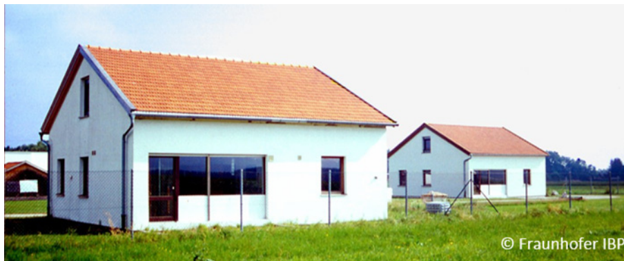
Figure 6. Twin test houses, each with four adjoining rooms for systematic testing of dwelling ventilation and alternative heating systems (e.g. heat pumps).

The energy crisis of 1973 had a strong impact on research demand. The possibilities for energy saving by adding thermal insulation to the building had been a research topic before, but due to the crises the insulation thickness went up and ventilation heat losses and inefficient heating systems came also into the focus. In order to enable systematic tests of ventilation and heating of dwellings, two similar test buildings (twin houses) with several adjoining rooms (in total about 100 m 2 ) have been erected. They were the “big brothers” of the former smaller test houses (Figure 6). Centralized and de-centralized ventilation systems with and without heat recovery, energy-saving building concepts, conservatories and translucent thermal insulation systems were the topics of investigation at the test houses.