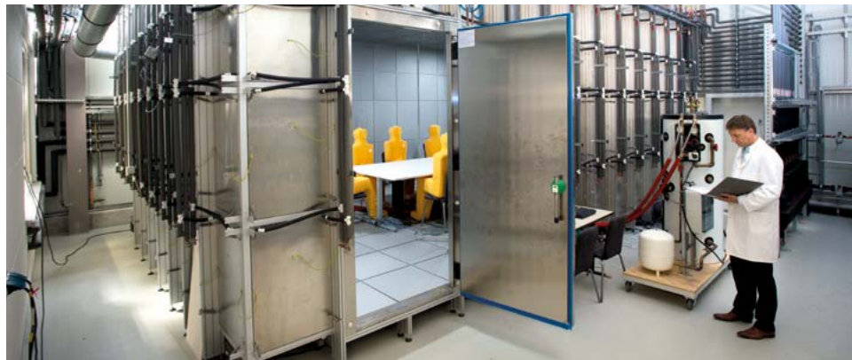
Exterior view of test room with modular heating/cooling panels.