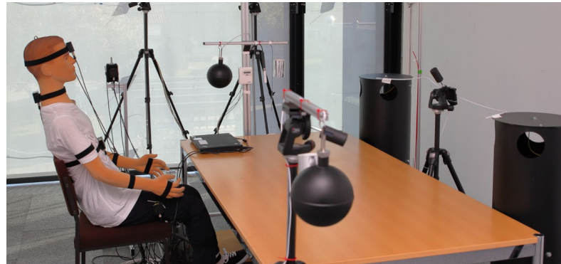
VERU Modular Test Facility for Energy and Indoor Environment Investigations